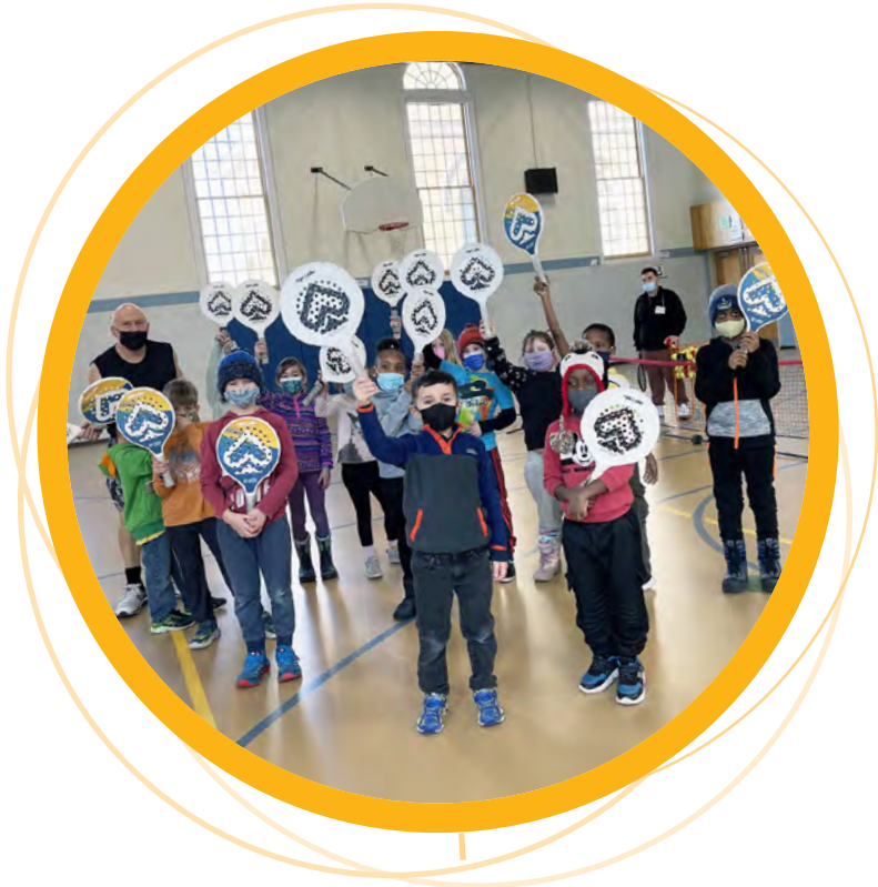
The “Kids on the Ball” school program is playing Spec in Burlington Vermont! (top left)