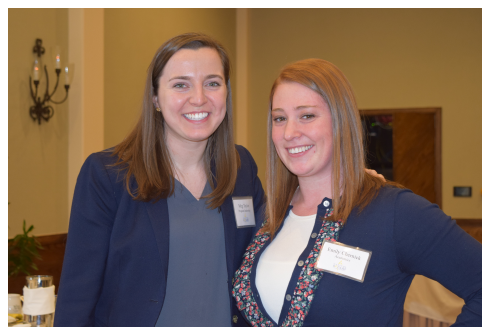
88 staff members from around the country gathered in Charlottesville, Virginia for the three-day National Staff Conference.