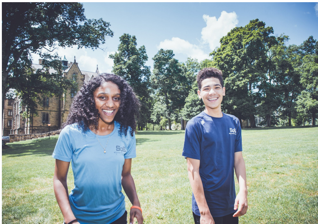
Boston's SquashBusters was one of 10 programs that traveled to Kenyon College in Gambier, OH for the Midwest Championships in July.