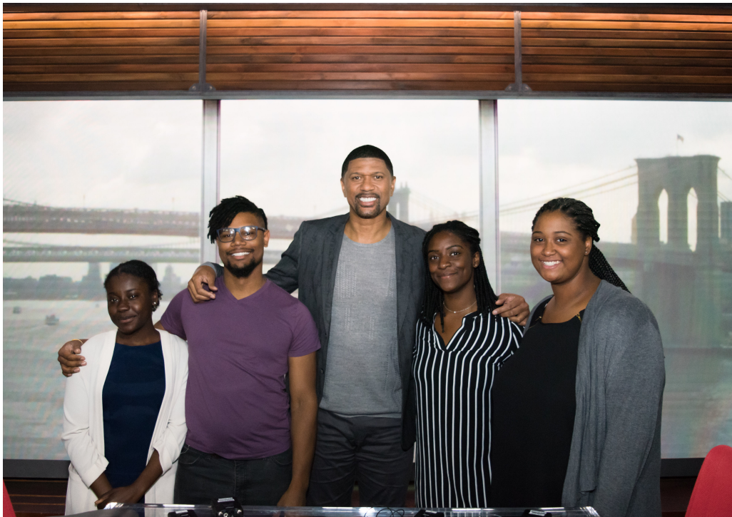
Students with Jalen Rose at ESPN during Career Connections Boot Camp in New York City in May.