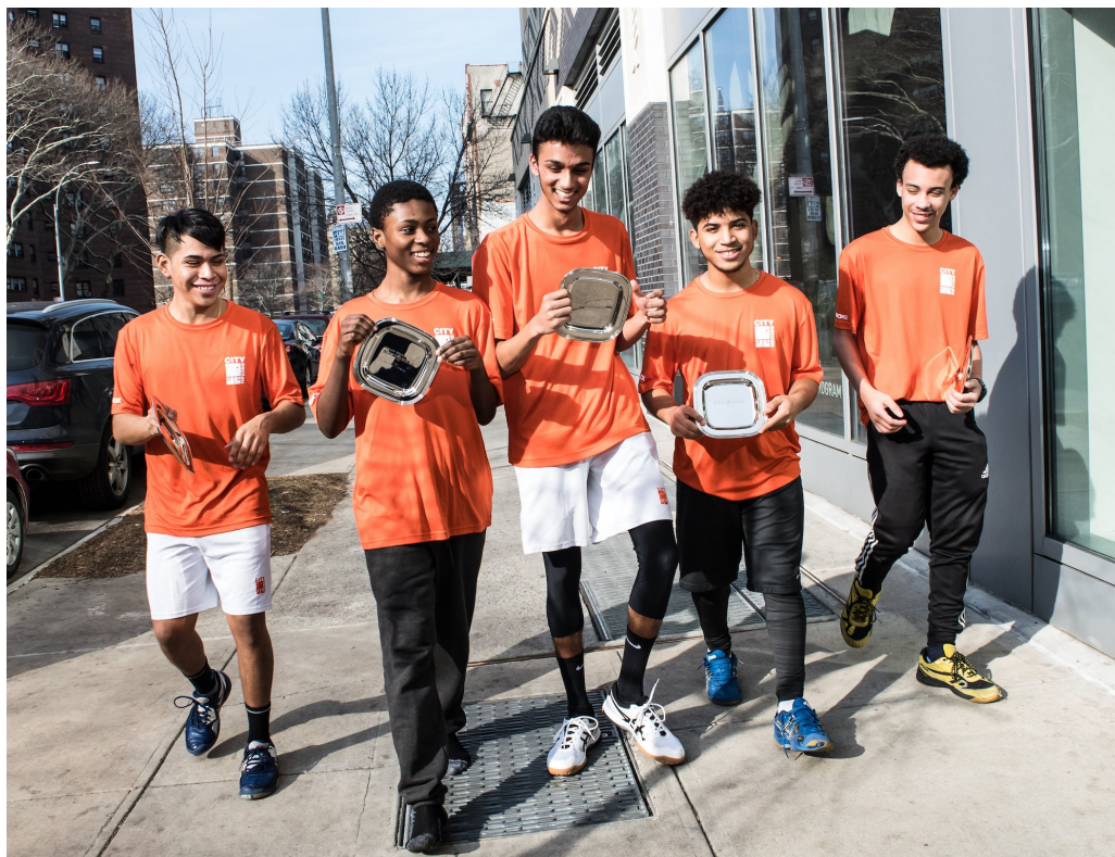
The CitySquash Boys Under 17 team celebrating their championship at Urban Team Nationals outside StreetSquash in Harlem.