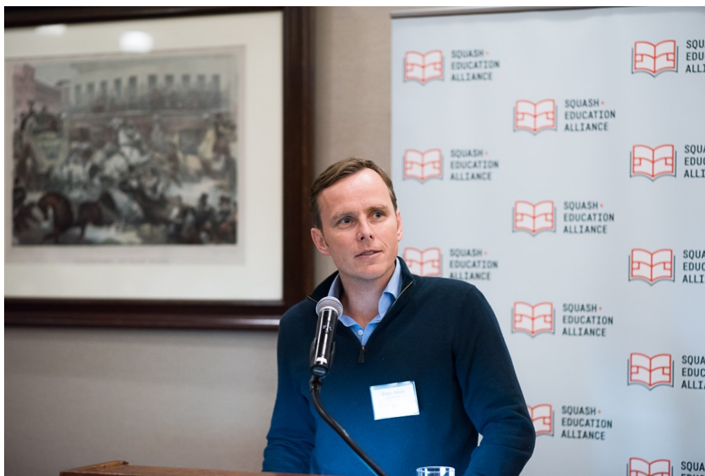
Former World Champion and CitySquash Board Member Peter Nicol at this year's Leadership Assembly in New York City.