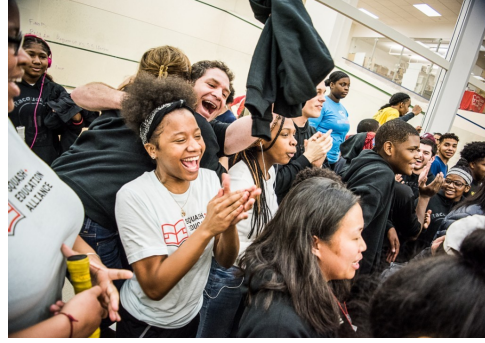
450 students gathered in New York City in January for the Urban Team Nationals, hosted by StreetSquash, Eastern Athletic Club, and Poly Prep Country Day School.