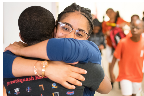
Students and staff at Urban Individual Nationals at Williams College and Amherst College in June.