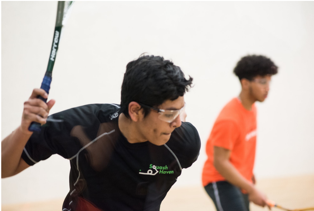
Players from Squash Haven and CitySquash engaging in an on-court battle at Urban Team Nationals.