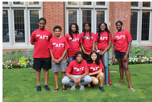
SEA sent 47 students to summer school programs located at eight boarding schools and three colleges.