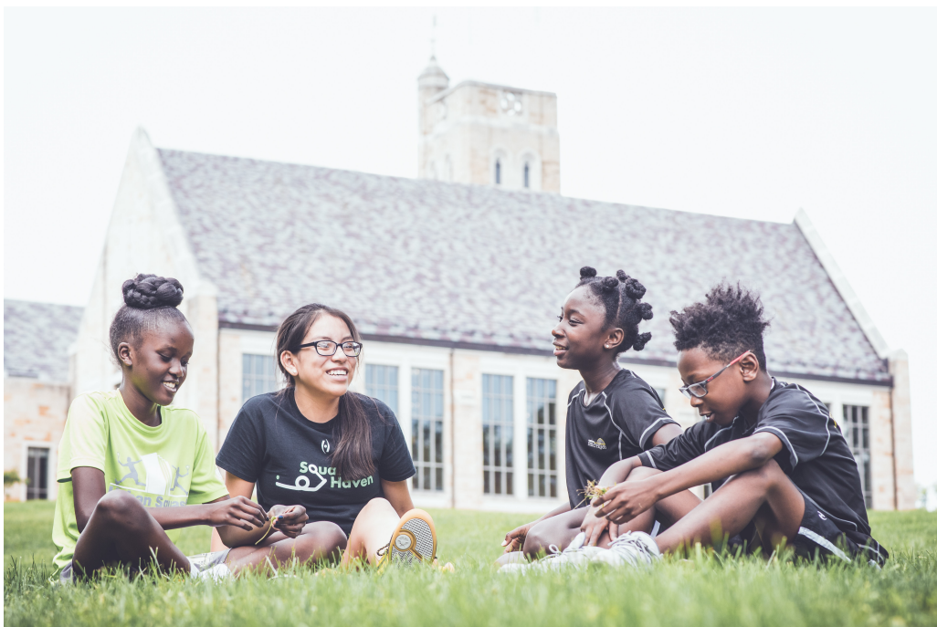
Students relaxing in the field at Midwest Championships in Ohio.