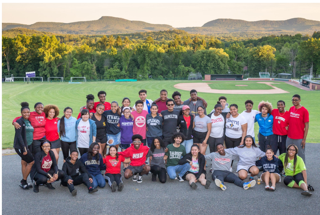
Members of the high school Class of 2018 at Urban Individual Nationals at Amherst College in June.