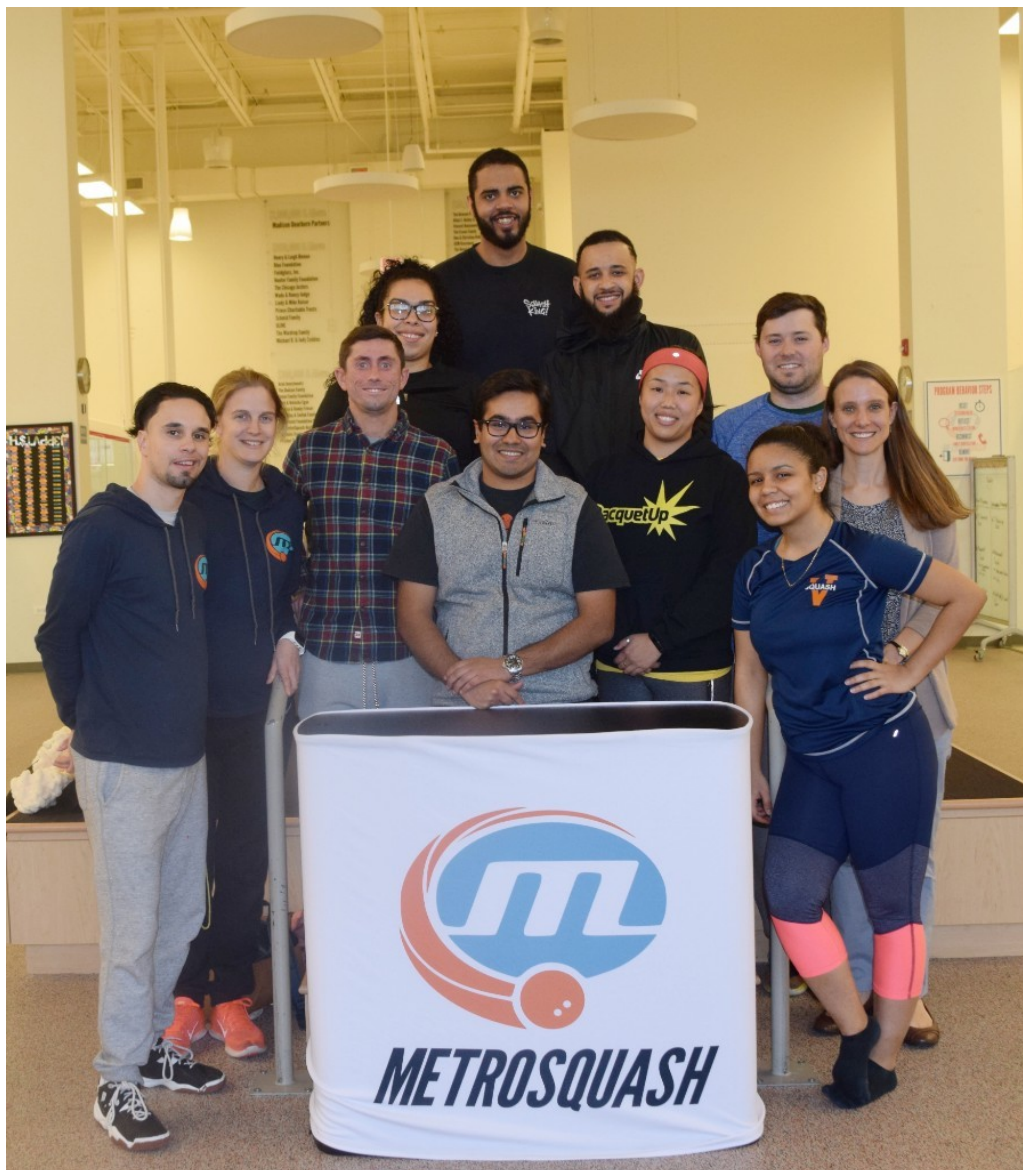
The Squash Leadership Committee convened telephonically and in-person throughout the year to develop best practices for the network.