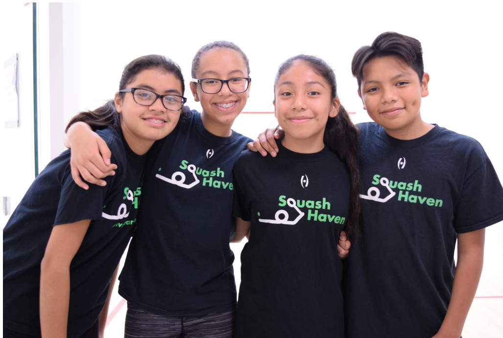
Squash Haven teammates supporting one another at Northeast Team Regionals at Yale in October.