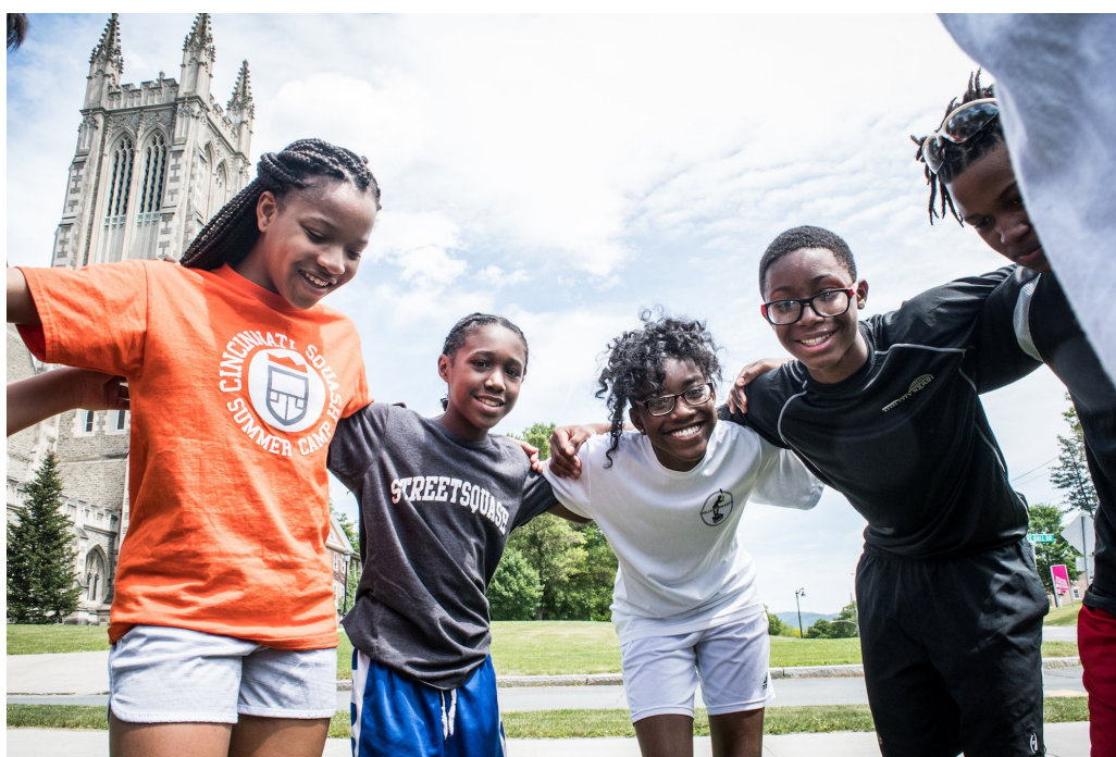
Students from Cincinnati, Harlem, Philadelphia, Pittsburgh, and Baltimore at Williams College for Urban Individual Nationals.