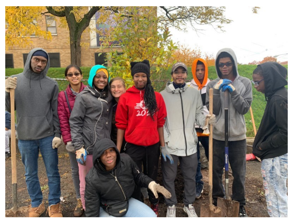
9th and 10th graders in Newark partner with the New Jersey Tree Foundation to learn about tree planting in Irvington County.

The first week of November was a busy one at StreetSquash. Over 150 students participated in service-learning activities, with the goal of creating positive change in their communities. For the first service week of the school year, students had opportunities to volunteer with the New Jersey Tree Foundation, the Harlem Rotary Club Food Pantry, Central Park Pick-Up, and NYC Votes.