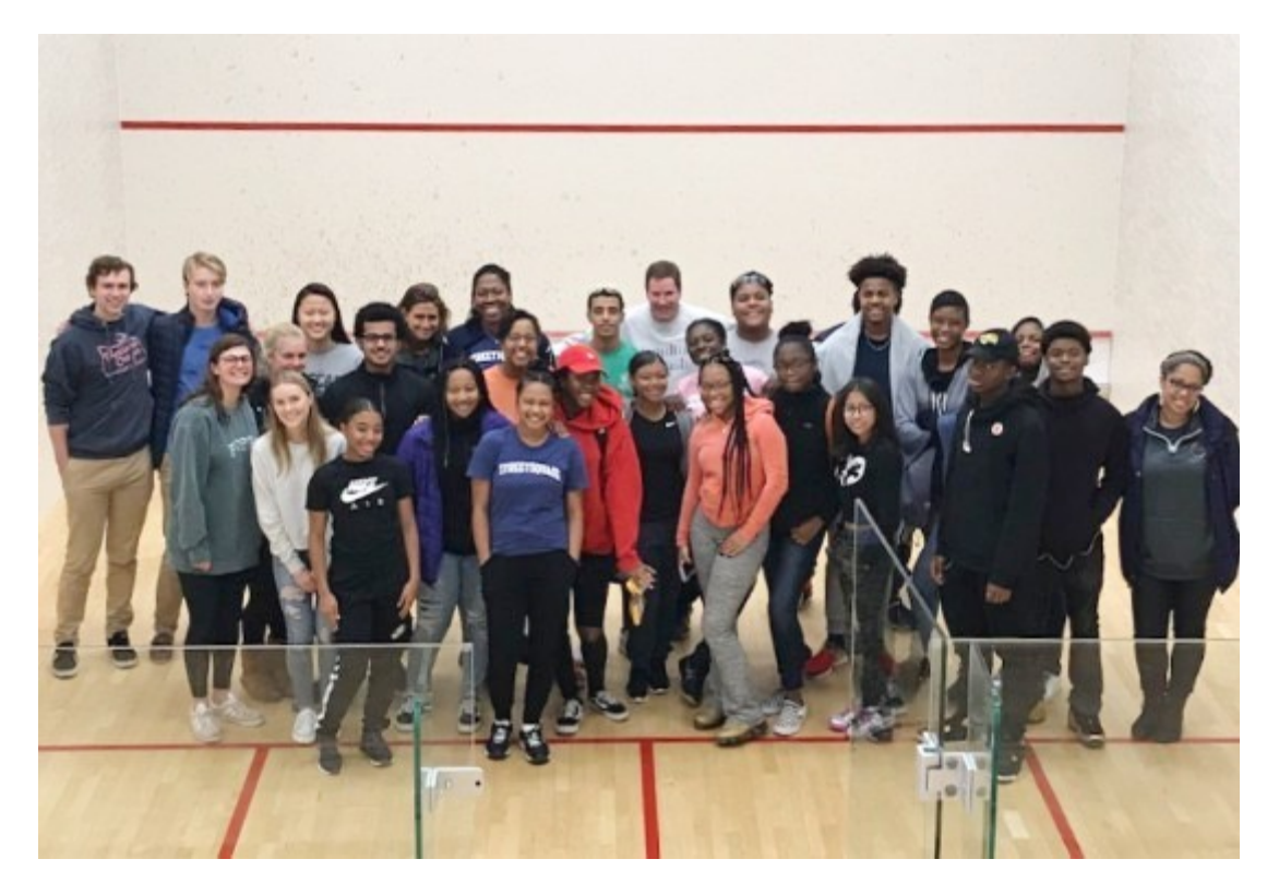
On court at Hamilton College, the men's and women's squash teams gather with students and staff.

As part of College Application Week, all staff members wore college gear from their respective alma maters. Our 7th through 11th grade students interviewed staff members during their academic and college prep sessions. Each staff member welcomed questions about their applications, academic studies, final projects, and athletic and extracurricular commitments. Students used this opportunity to learn about college life at a variety of different schools, and to broaden their ideas about where they might apply in the coming years.