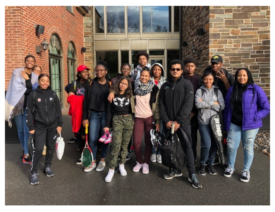
10th and 11th grade students enjoy a sunny fall day at Hamilton College for a campus tour.