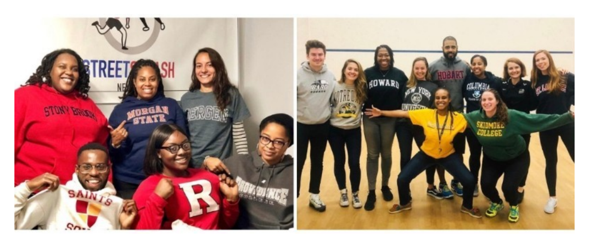
Staff in Newark (left) and Harlem (right) wear their college gear as ambassadors of the college experience for students.

On October 22nd, College Application Week launched at StreetSquash. The national initiative, brought to StreetSquash by the College Access and Success Department, coincided with the first round of college application deadlines. This year, as in years past, all 35 students in the Class of 2019 will apply to college